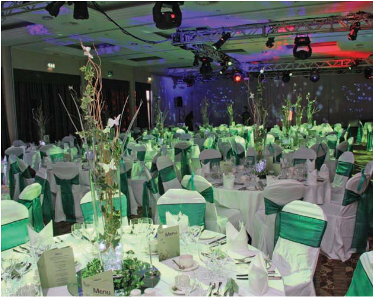
The Continental Suite Wedding Breakfast: Maximum 270 Evening Reception: Maximum 300