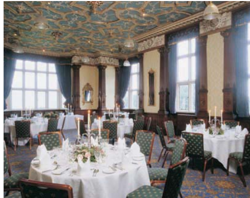
The Drawing Room Wedding Breakfast: Maximum 80 Evening Reception: Maximum 120