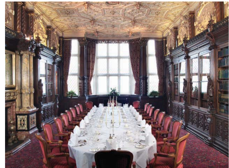
The Great Library Wedding Breakfast: Maximum 50