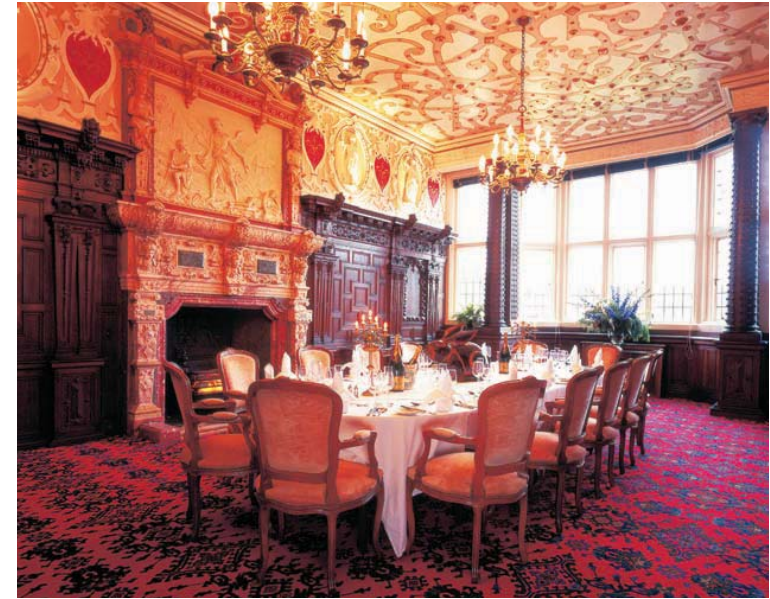
The Carved Parlour Wedding Breakfast: Maximum 40