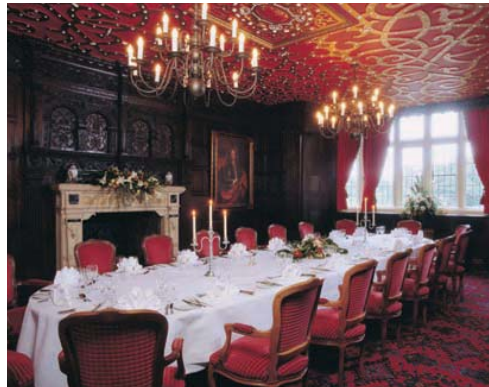
The Oak Parlour Wedding Breakfast: Maximum 20