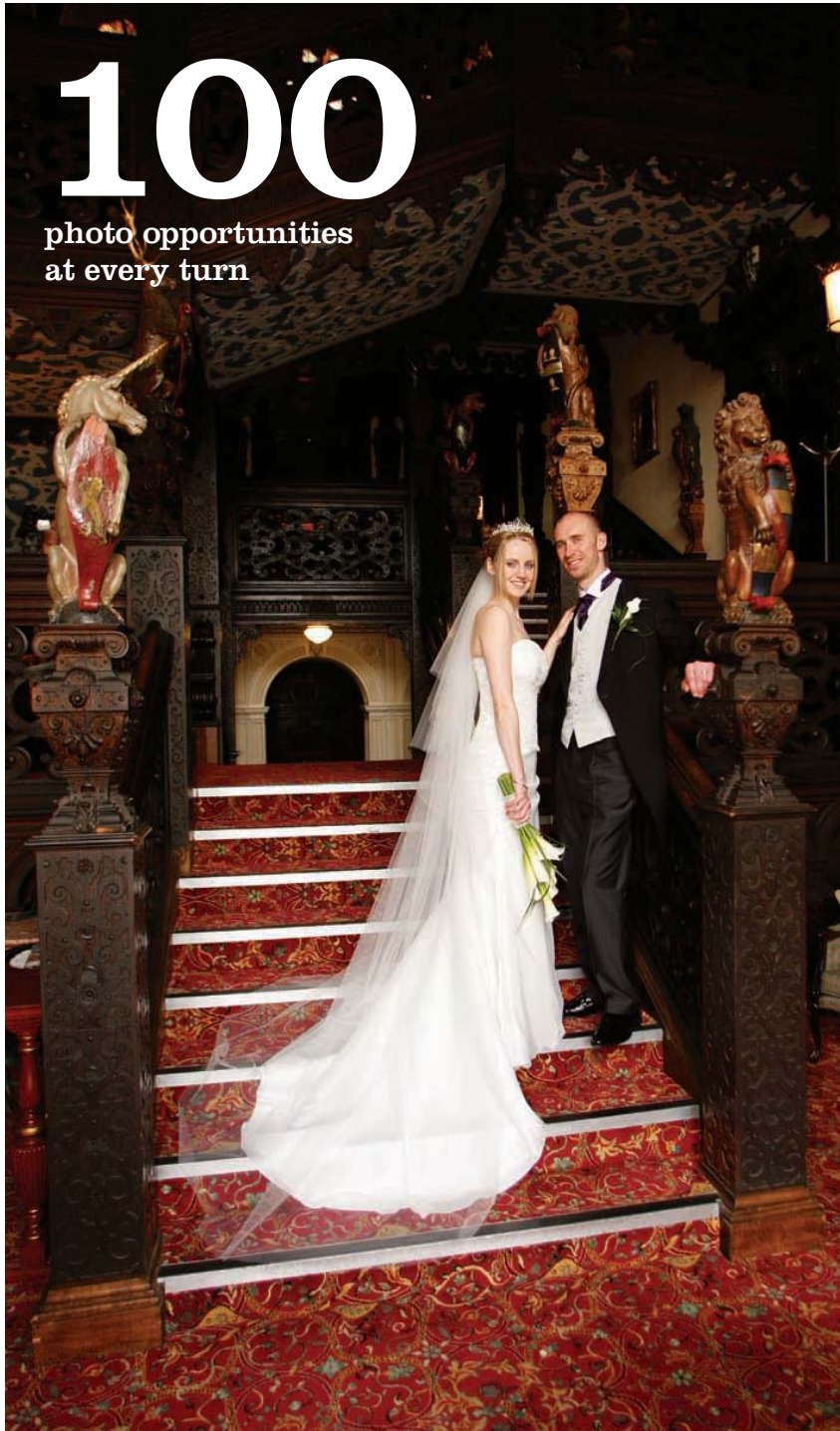
photo opportunities at every turn