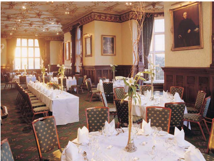
The Long Gallery Wedding Breakfast: Maximum 180 Evening Reception: Maximum 250