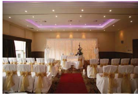
The Arnage Suite Civil Ceremony: Maximum 180